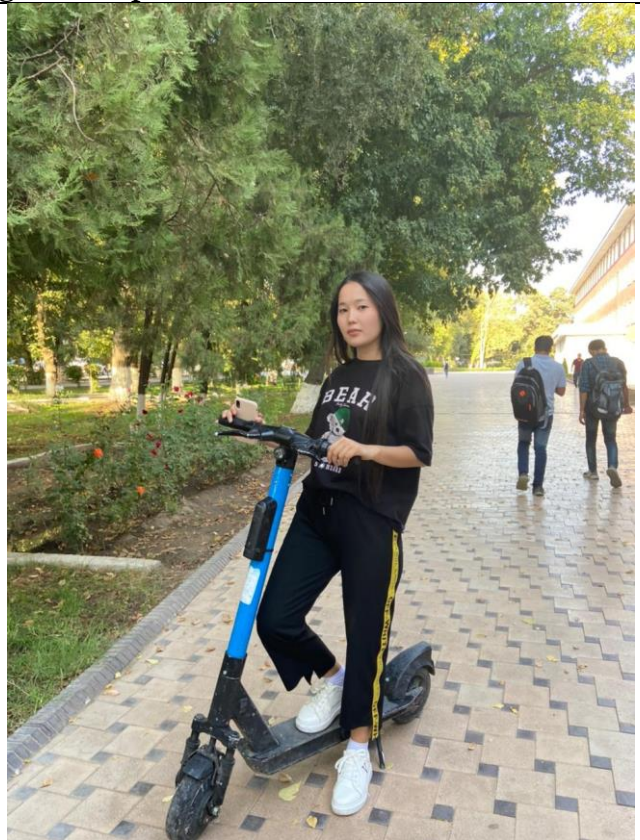
Students of M. Auezov SKU can use scooters for free