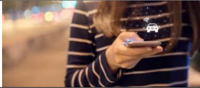
Sharing of transport