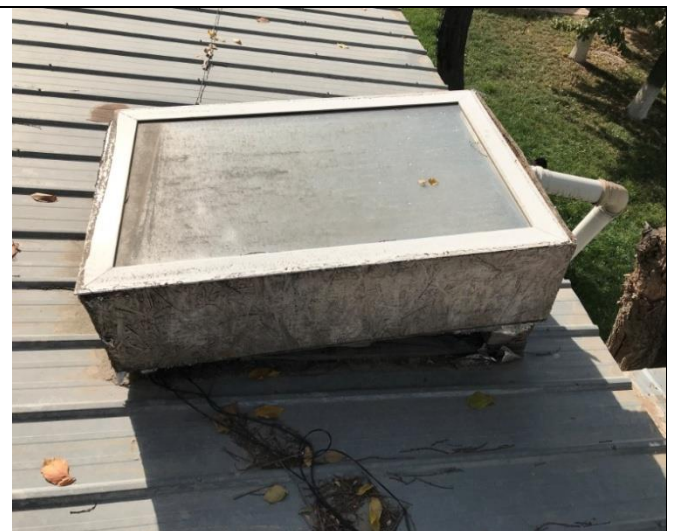
Heliocamera for solar energy accumulation