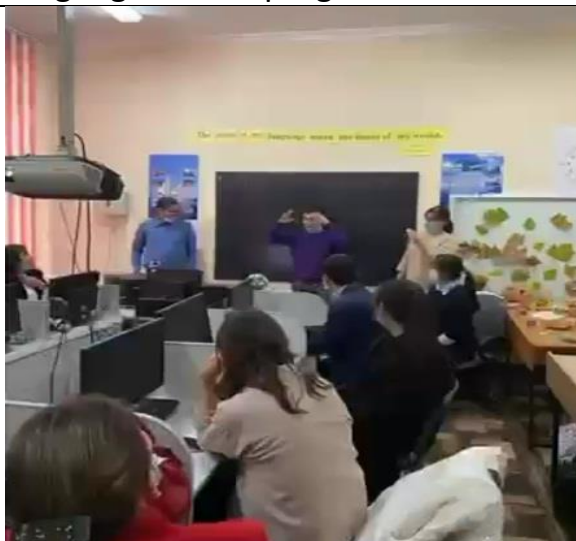
Workshop on Learning how to use Microsoft Teams, Zoom, social networks

https://www.instagram.com/p/CiHhmbUDBxR/