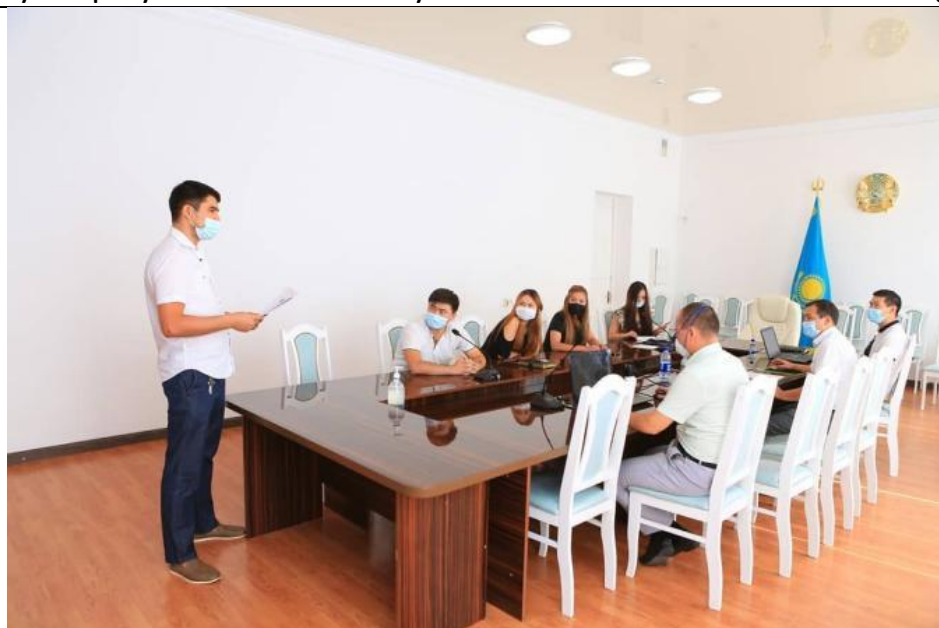
New equipment for video conferencing