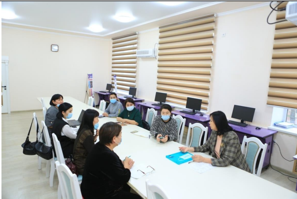
Program for methodical courses

https://auezov.edu.kz/rus/home-ru-ru/3205