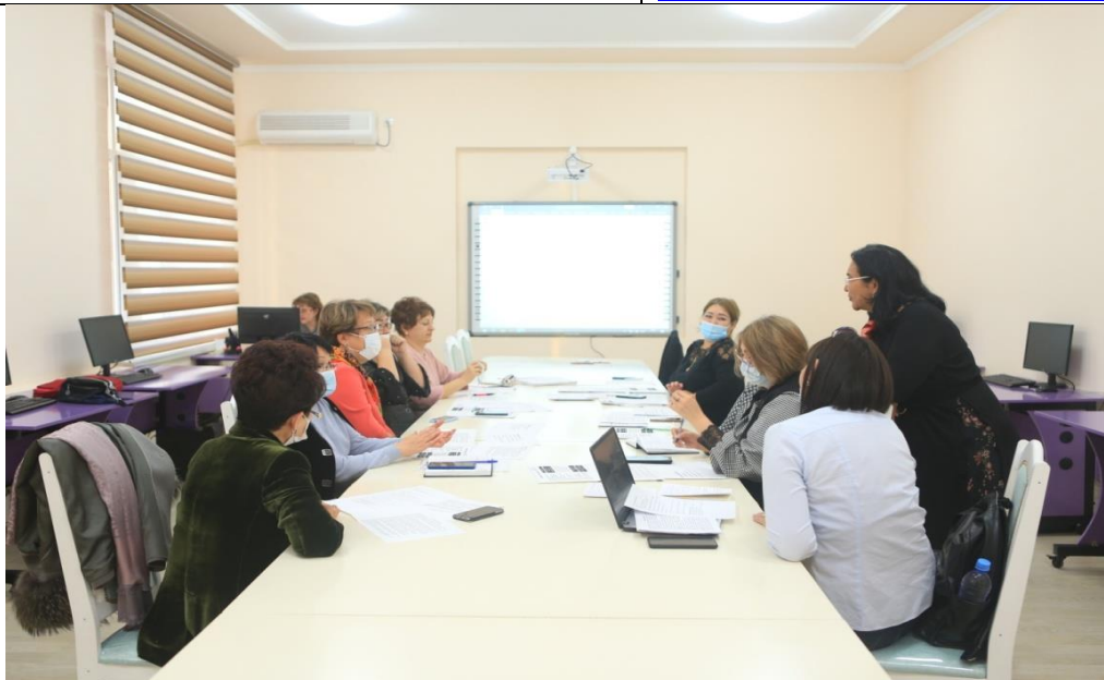
Language course program

https://auezov.edu.kz/rus/home-ru-ru/3205